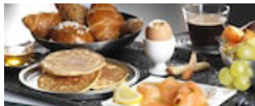
A delicious, generous breakfast buffet Served in the Parkside Diner restaurant