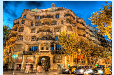
Casa Mila (La Pedrera)