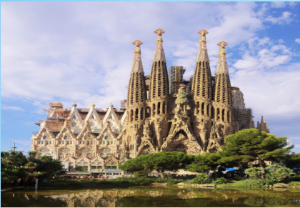
Basilica de la Sagrada Família