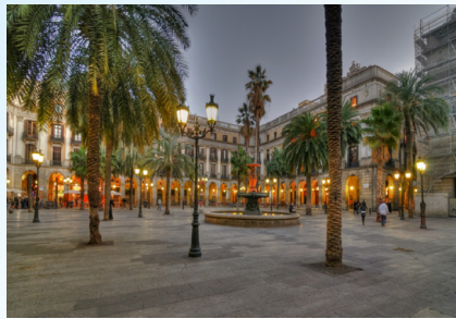
La Rambla Barcelona's Social Hub