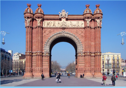
Arc de Triomf