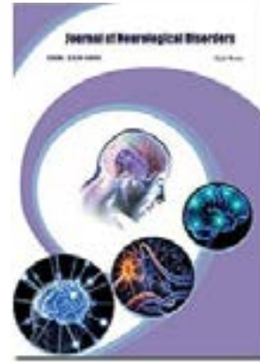
Journal of Neurological Disorders