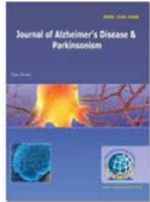
Journal of Alzheimers Disease & Parkinsonism