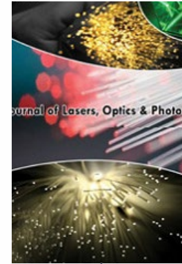
Journal of Lasers Optics Photonics