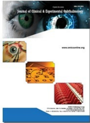
Journal of Clinical Experimental Ophthalmology