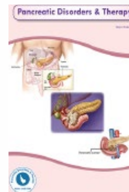
Pancreatic Disorders & Therapy