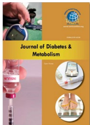
Journal of Diabetes & Metabolism